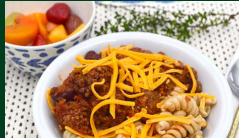
Beef Chili Mac