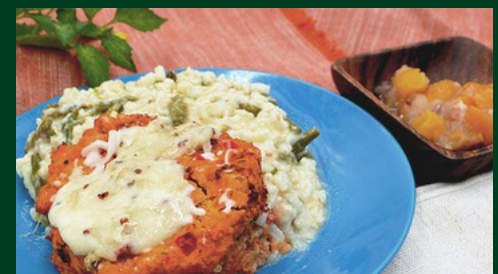
Provencal Bean Cakes