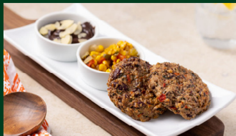
Jamaican Red Bean Cake